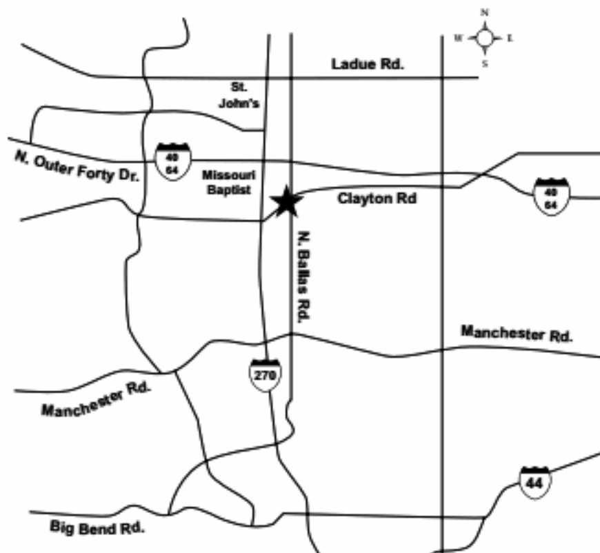
N.W. corner of Ballas and Clayton Roads